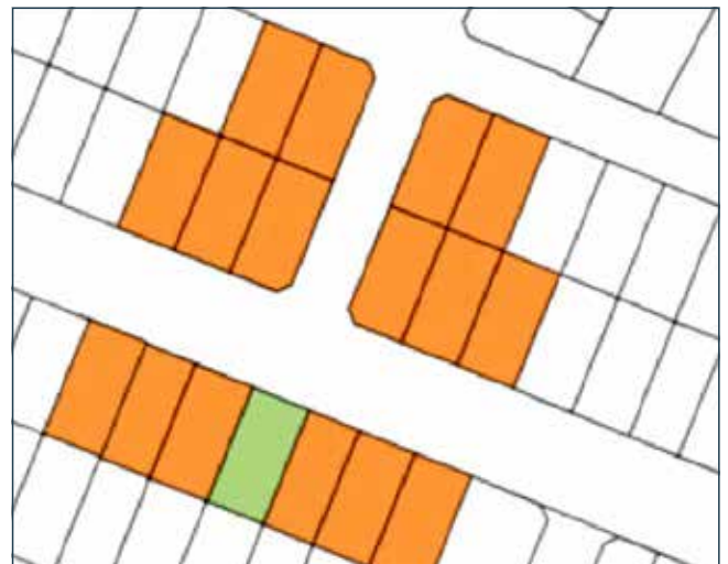
Section layout demonstrating identical façade rule.

No concept designs and or façade only submissions will be accepted, i.e. submissions must include all information as requested on the Design Approval Application Form to initiate the approval process.