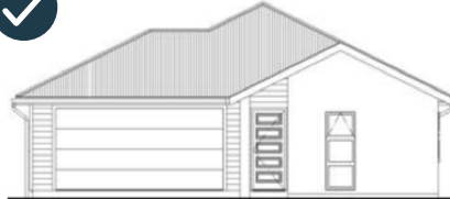
Acceptable gable & hipped roof