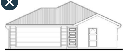
Unacceptable gable & hipped roof