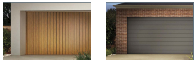
(TOP) Example of a swing in garage (plan). Example of acceptable garage doors types.