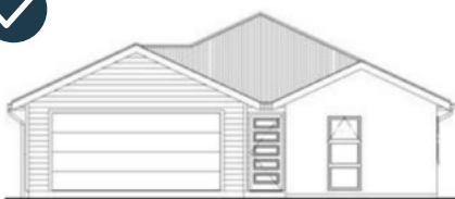
Acceptable double gable roof